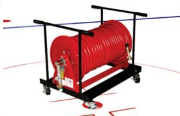
Hose Reels (Optional Stands)