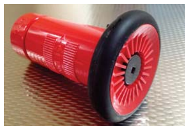
Lexan Spray Nozzle

Ask us about our other accessories available!